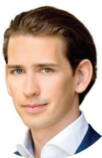
Sebastian Kurz - Federal Minister for Europe, Integration and Foreign Affairs, Austria

This year's Vienna Energy Forum with its record participation confirmed Vienna's role as an international energy hub. We were delighted to welcome not only high ranking officials, but also a great variety of representatives from the global civil society and from business communities, and we are especially proud of our certificate as a "green event". All this shows us the way to go forward.