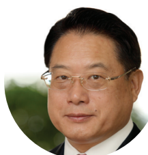
Li Yong – Director General, United Nations Industrial Development Organization (UNIDO)

This year's Vienna Energy Forum with its record participation confirmed Vienna's role as an international energy hub. We were delighted to welcome not only high ranking officials, but also a great variety of representatives from the global civil society and from business communities, and we are especially proud of our certificate as a "green event". All this shows us the way to go forward.