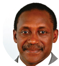
Kande K. Yumkella – Special Representative of the UN Secretary General and Chief Executive Officer, Sustainable Energy for All (SE4ALL)

The Vienna Energy Forum 2015 clearly demonstrated that sustainable energy is a key foundation for inclusive and sustainable industrial development and is inextricably linked with achieving the Sustainable Development Goals and combating climate change.